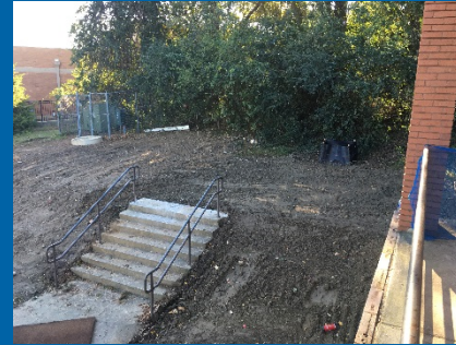
Demo of Sidewalks at 2021 Building Entrance