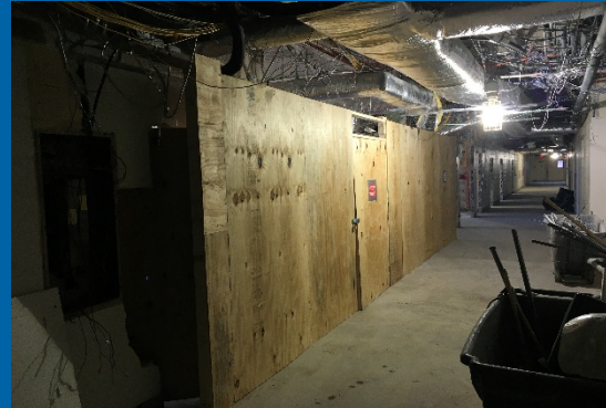
Controlled Access Zone for Entry Stair Demo