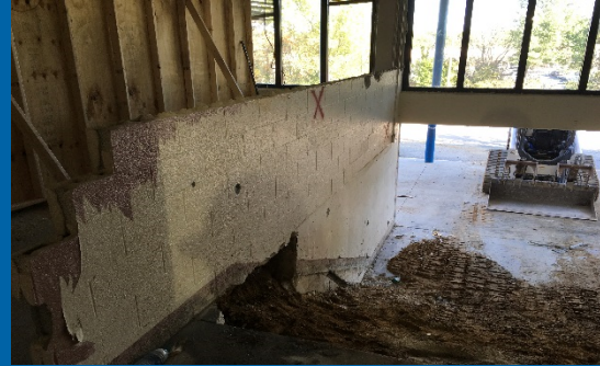
Demo of Main Entry Stairway and Masonry Walls