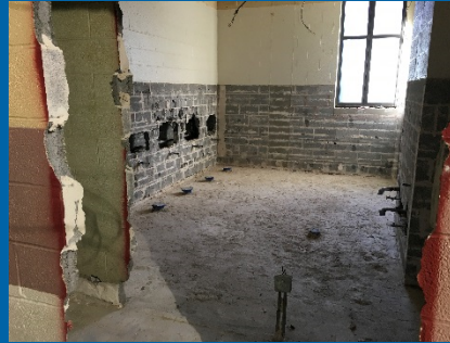
Restroom Demo at 2010 Building